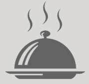
FOOD & GOODS DELIVERY