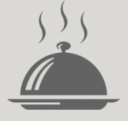
FOOD & GOODS DELIVERY